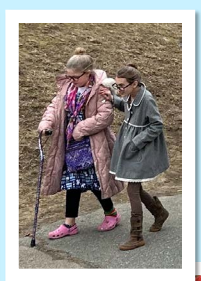
"Dress Like You're 100 Years Old" can have many interpretations, but our favorite is, have fun!