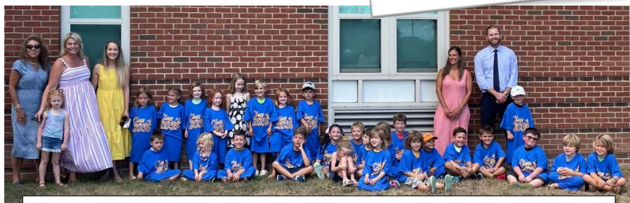
KINDERGARTENERS ENJOYED A POPPSICLE WITH THE PRINCIPALS YESTERDAY!