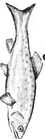
with their eyes open