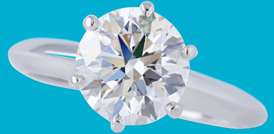
3 Platinum Diamond Rings from Tiffany's