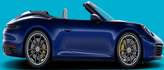
Porsche 911 Carrera Cabriolet