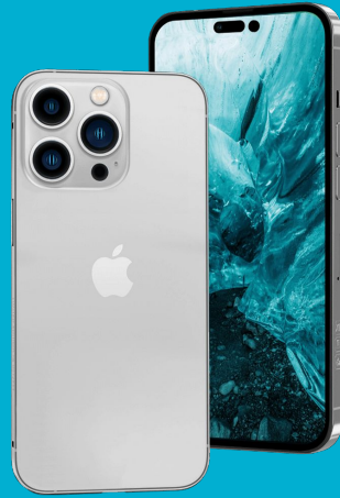
150 iPhone 14s